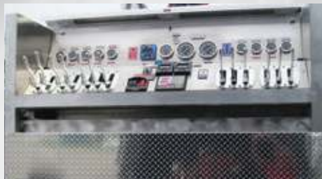
Top Mount Control Panel