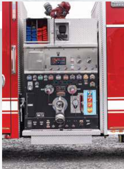
Black Thermal Coated Control Panel