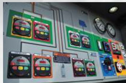
Logi-Color Pump Control Panel