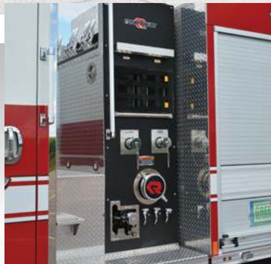
TP3 Pump Control Panel with Sealed Bank