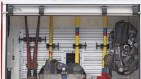
Customizable Tool Storage