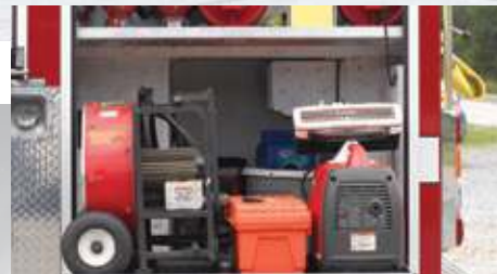
Slide-Out Equipment Trays