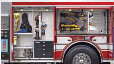
Full-Depth, Full-Height Side Compartment