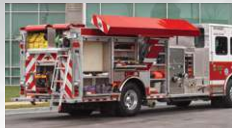
Enclosed Ground Ladder Storage