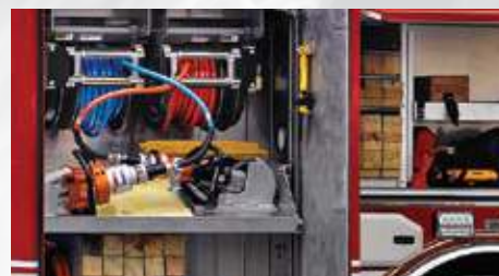
Full-Width Access Compartments