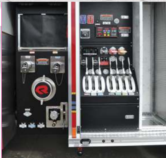
MP3™ Pump Control Panel with Sealed Bank