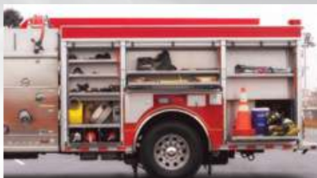
Customized Compartment Storage