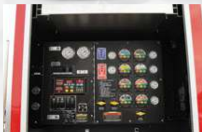
Curb Side Pump Control Panel