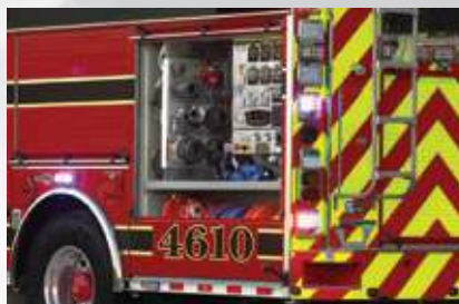
Operator's Side Pump Control Panel